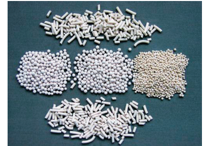
Figure 3: Molecular Sieve Media

While a variety of H 2 S removal methods exist, selecting the best method for a facility involves demand, space, and CAPEX/OPEX considerations. The most commonly used method for the oil & gas industry tend to be liquid scavengers in the form of amine towers or triazine direct injection. If footprint space allows, triazine contactor towers can greatly increase efficiency and reduce OPEX.