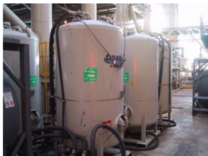
Figure 3: Carbon Filter

Upstream engineering for offshore oil and gas specializing in: